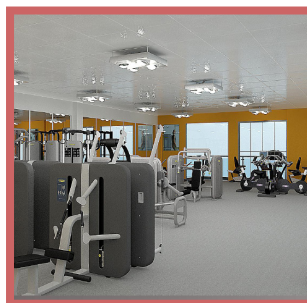
Pool (top) and artist's impression of Fitness Studio

However, there are only 300 memberships available for students. Sixth formers are being offered the first opportunity to join, and have until 18th November to sign up. Other students will then be offered any remaining memberships.