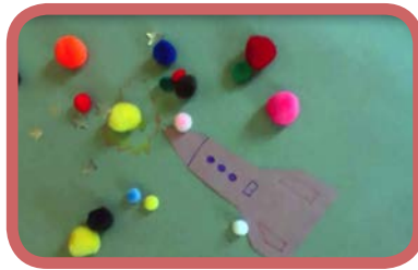
still from Rocket animation

On Monday 20th August 12 incoming Year 9 students joined us for our 3rd Summer School, with their parents and carers. The event was organised by several members of the Education Extra team, and run jointly this year with members of the Locality Team. The Summer School ran over three days, with the young people enjoying a variety of experiences, including an animation workshop, trying out the climbing wall and cooking pizzas and cakes. Members from Crossways Youth Club ran a session on team building, ensuring that the students have skills to support each other when they joined us in September.