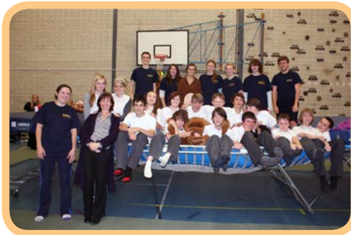
Bouncing for Borneo

Tickets are available free of charge from Reception for the Community Lecture on 24th September 'What Happens When The Oil Runs Out'.