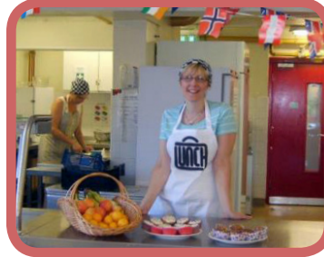
Volunteers getting ready